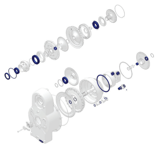
Level 1 Torque Converter Repair Example