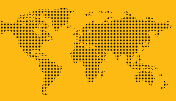
With more dealer locations around the globe than any other heavy equipment manufacturer, the Caterpillar® dealer network assures you or your operator are never very far from Cat parts, service and sales expertise.

The Cat dealer network assures a common approach to parts available and quality of service, regardless of where the job takes you and your equipment.