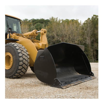
The Caterpillar Fusion Coupler System includes a full line of buckets for use in a wide range of job site situations.