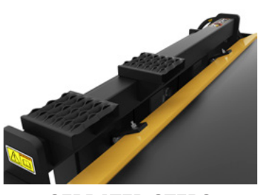
SERRATED STEPS Wide steps with grating and large profile serrations provides better traction and stability when entering and exiting machine.

PIVOTING INTERFACE Pivoting interface allows the drum to oscillate ± 15 degrees and follow the contour of the ground.