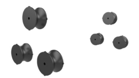
REPLACEABLE RUBBER MOUNTS Replaceable rubber mounts isolate vibration and enhance vibratory capabilities.