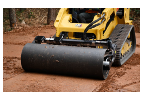
HIGHER COMPACTION FORCES High compaction forces result in fewer passes for greater productivity.

Caterpillar exclusive vibratory pod design delivers desired balance between frequency and amplitude to provide a superior matte finish.