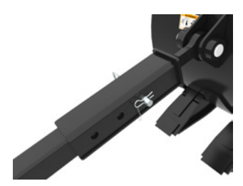
Stiff link can be manually adjusted in three positions by repositioning the pin position. No special tools are required.