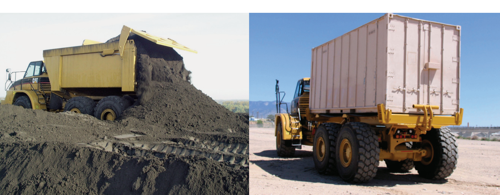
* Long Wheel Base: available second half of 2014.