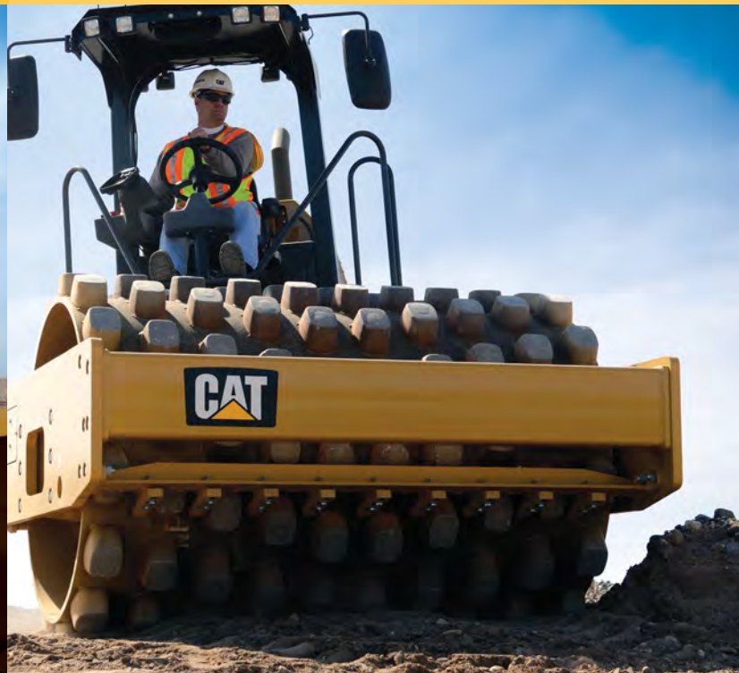
As the soil becomes stiffer, the MDP value increases.