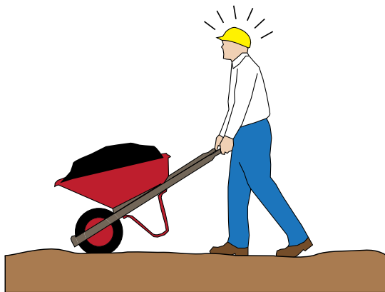
The wheelbarrow tire sinks into loose soil, requiring greater effort to push it through.