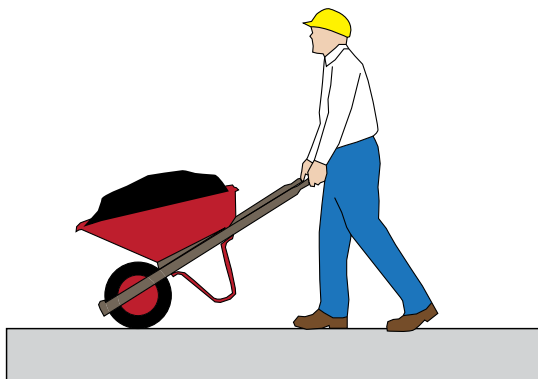
The wheelbarrow tire rolls easily on the smooth, stiff concrete.

MDP measures the amount of power required for the soil compactor to propel over the soil, providing an indication of the load bearing strength.