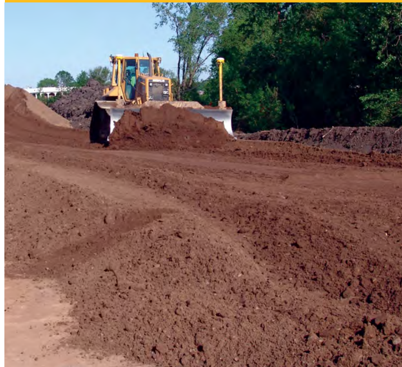
Constructing a test section.